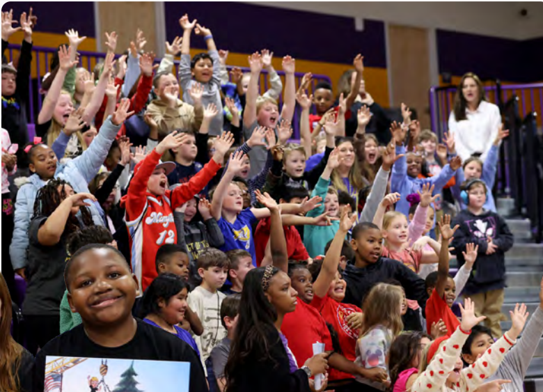
Read to Achieve began in February in Osceola County for a tip-off pep rally.