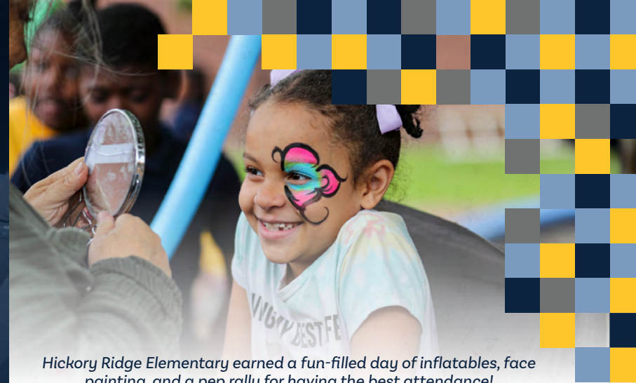
Hickory Ridge Elementary earned a fun-filled day of inflatables, face painting, and a pep rally for having the best attendance!

4 SCHOOLS IMPACTED IN FOUR ZIP CODES 38104, 38115, 38116, 38127