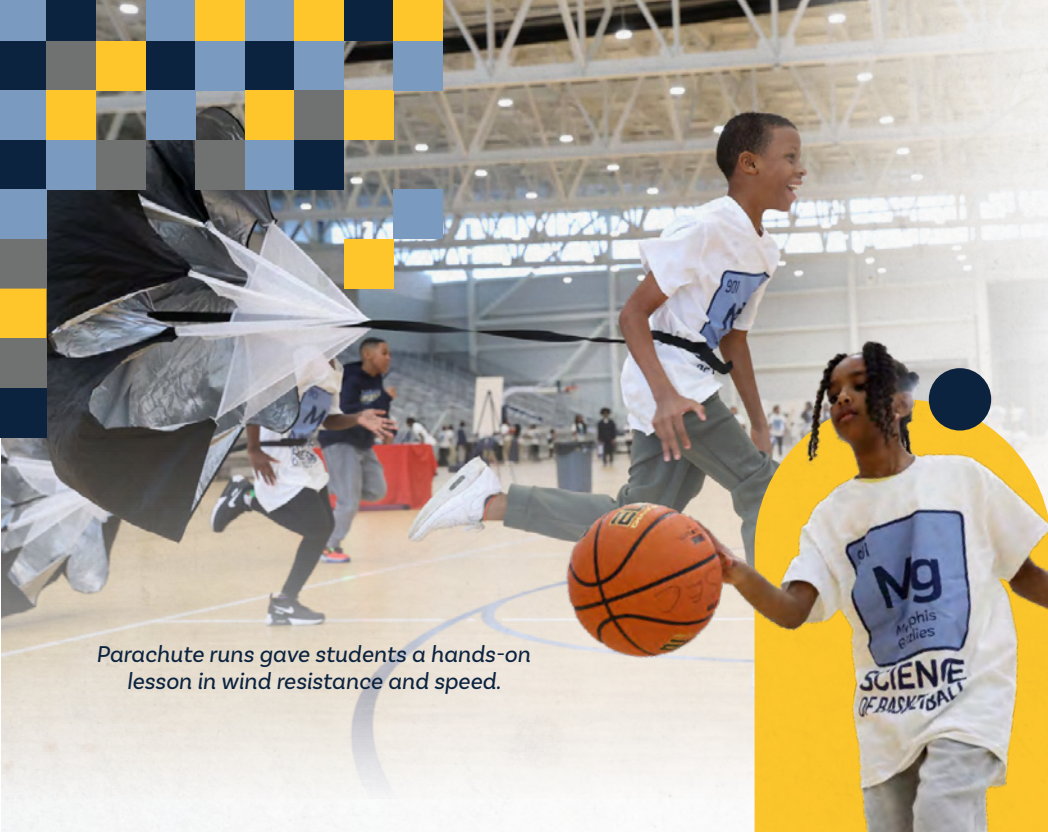
Parachute runs gave students a hands-on lesson in wind resistance and speed.