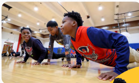
Students enjoyed Grizz Fit through fun, interactive workouts.