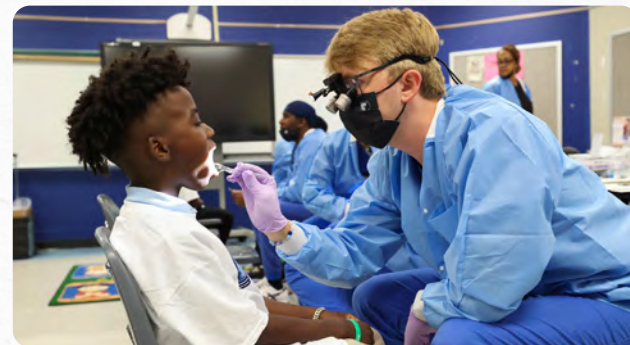
Students kicked off the new school year with dental screenings provided by Delta Dental of Tennessee.