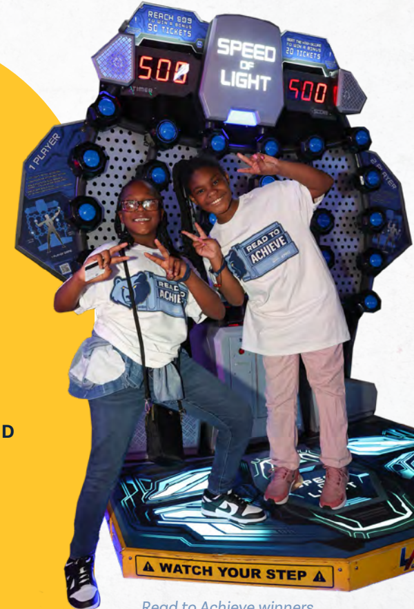
Read to Achieve winners celebrated with food and fun.